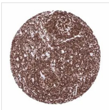
GTX04432 IHC-P Image

IHC-P analysis of human diffuse large B-cell lymphoma (DLBCL) from lymph node tissue using GTX04432 CD45 antibody [MSVA-045R] HistoMAX™. Diffuse large B cell lymphoma showing strong CD45 staining of tumor cells.