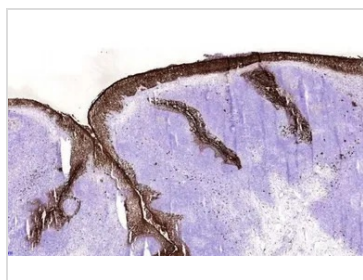
GTX17050 IHC-Fr Image

ELISA analysis of human blood monocytes using GTX17050 S100A8 + S100A9 antibody [27E10]. Dilution : 0.5-2 µg/ml