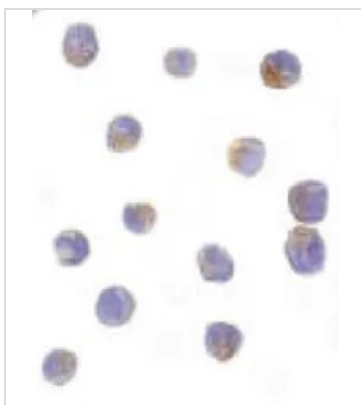
GTX28419 ICC/IF Image

Immunocytochemical staining of DRAK2 in Jurkat cells with DRAK2 antibody (GTX28419) at 10µg/ml.