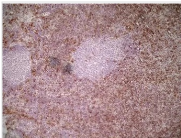
GTX39790 IHC-Fr Image

IHC-Fr analysis of mouse lymph node tissue using GTX39790 Ly-6C antibody [ER-MP20].