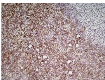
GTX39790 IHC-Fr Image

IHC-Fr analysis of mouse lymph node tissue using GTX39790 Ly-6C antibody [ER-MP20].