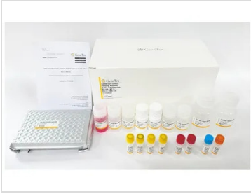
GTX538288 Neutralizing /Inhibition Image